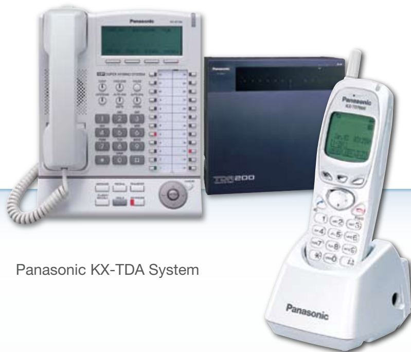
Panasonic KX-TDA System

“It’s very successful because the hybrid capability allows us to continue to utilize our existing infrastructure ”